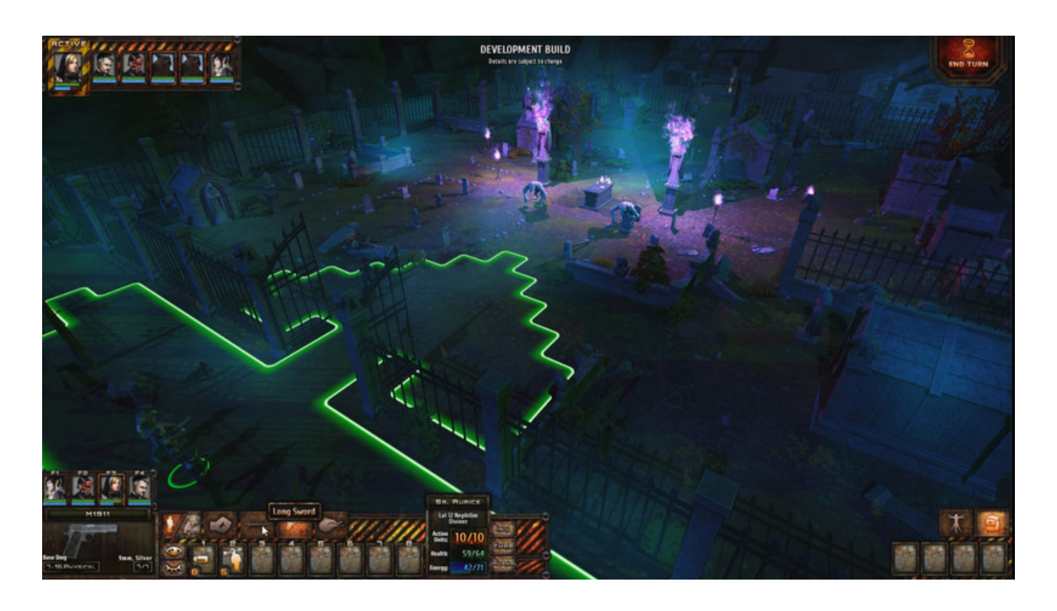
Download ->->-> http://bit.ly/2NH386a