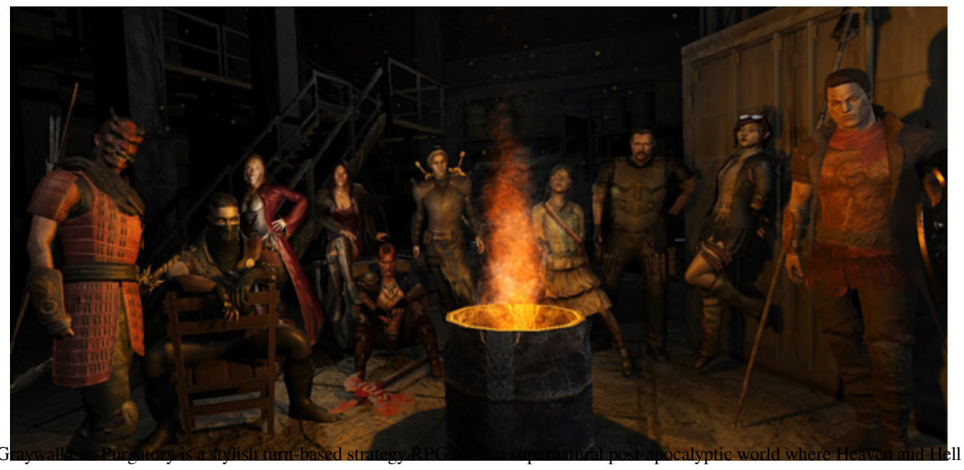
had merged with Earth caused by a event called the Rupture. Inspired by a combination of gameplay from XCom, Jagged Alliance and Fallout, the game generates a unique but familiar experience for the turn-based tactics player.